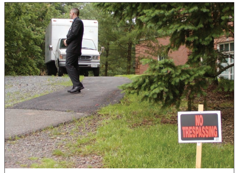
A U.S. federal security agent patrols the Marriott grounds.

I went down to the bar and began to chum around with the barkeep. "I hear they are kicking everyone out of the hotel on Thursday. What's the big event?" "I'm not allowed to talk about that," was his response. "So, what's the big event coming up this weekend?" I asked the front desk attendant. "Sorry, but we are not permitted to discuss that," she replied.